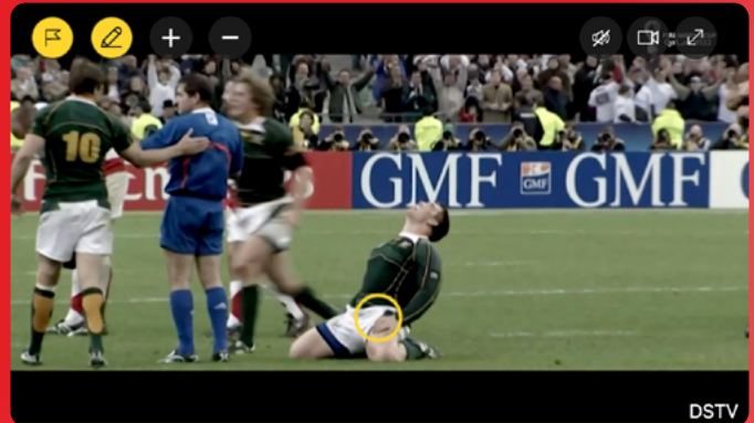
✓ Make game annotations on the fly

Mobii's video review software is made available through a web browser-based application on the Mobii Encoders & via Connect cloud. Multiple users can join a secure session and work collaboratively from any device both locally at the stadium or remotely. With on-site Microblock enabled encoders, multiple streams can be delivered to remote production studios, globally, in real-time and in different output formats. This significantly reduces operating and logistics costs while maintaining performance efficiencies.