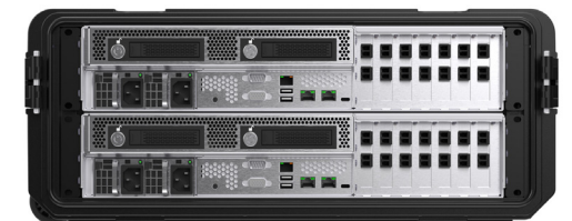
Dual 2U configuration in 4U case