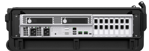
Single 2U configuration in TSA carry-on compliant case